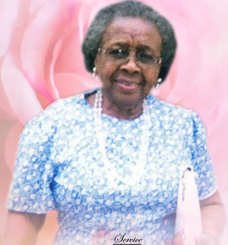
Thursday, January 13, 2022 • 12:00 noon