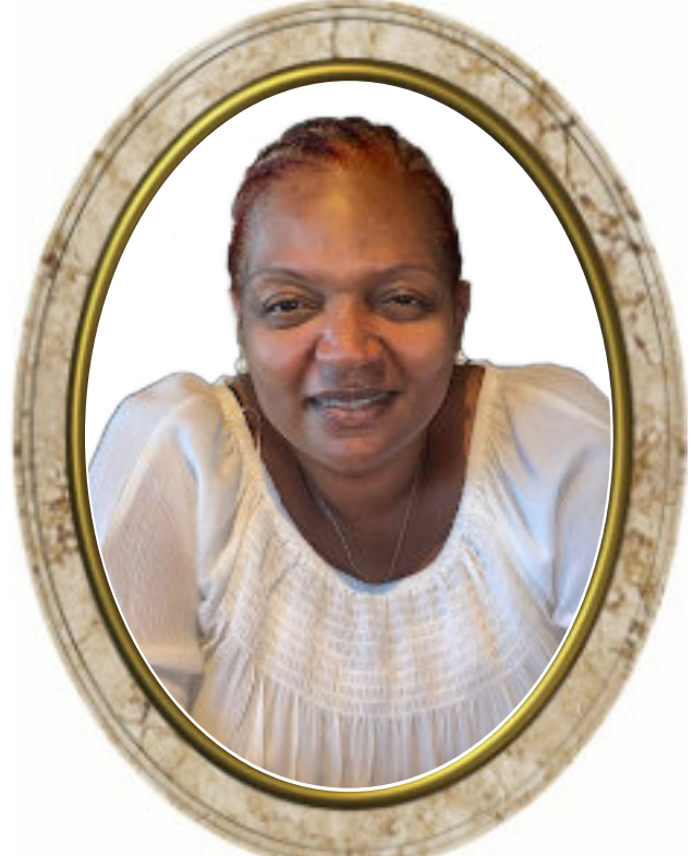
Sunset August 1, 2021