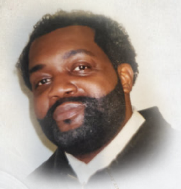
Service Wednesday, March 24, 2021 • 5:00 p.m.