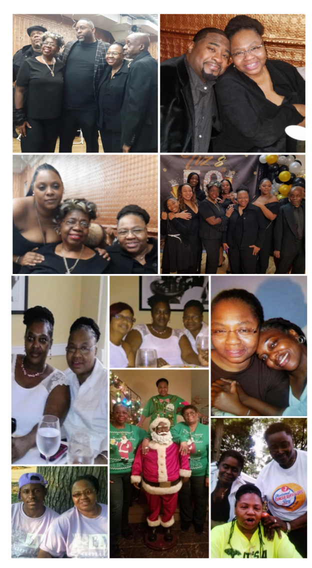
FINAL DISPOSITION: Rosehill Crematory Linden, New Jersey