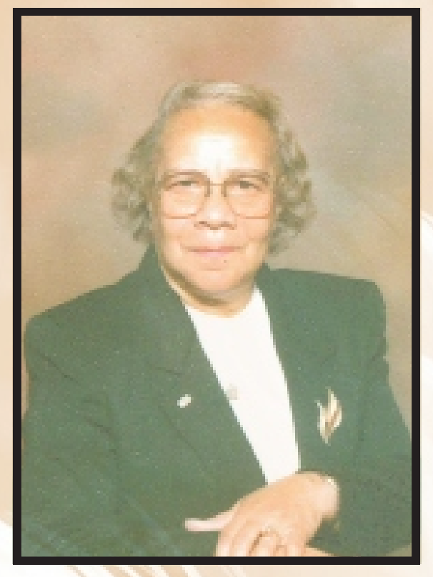
August 19, 1929 - July 21, 2020

Service Tuesday July 28, 2020 - 11:00 AM