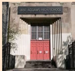
Jane Addams HS