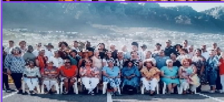
Global Linkages - Journey to South Africa 2020