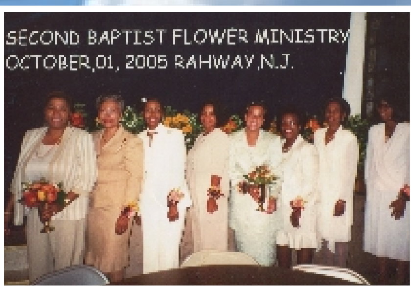
SECOND BAPTIST FLOWER MINISTRY OCTOBER, 01, 2005 RAHWAY, N.J.