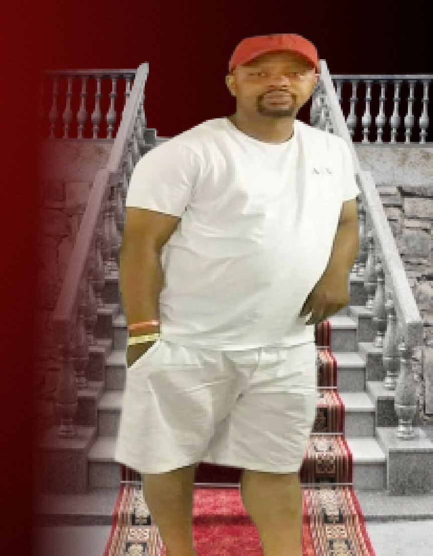
Sunrise: July 24, 1976 Sunset: November 27, 2019