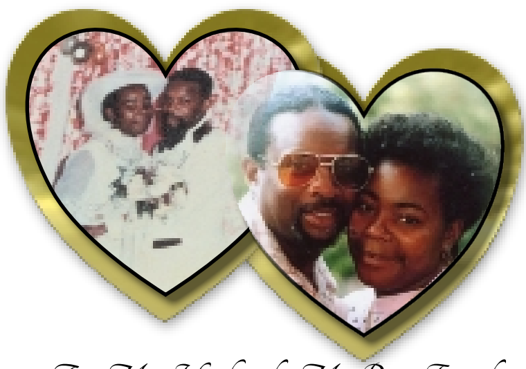
To: My Husband, My Best Friend, My Everything, My Soulmate,

I loved you for so many reasons. You loved me so much. You gave me and our children anything we wanted and everything we needed. You were the perfect husband. You gave the very best of yourself. We traveled so many places. We created so many memories that will forever be embedded in my heart. The best place I could ever be was always with you. I knew God loved me so much because he blessed my life with the gift of your love. He made you especially for me. My beautiful angel, please continue to watch over us from above. I'll see you when I get there.