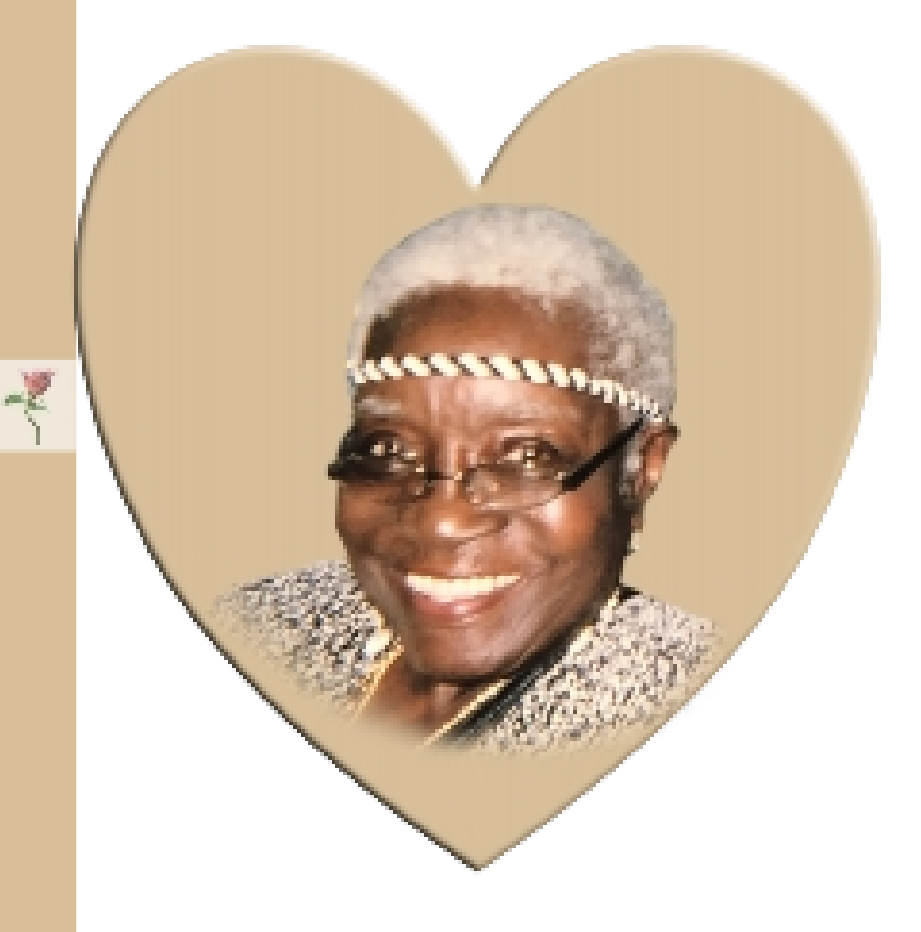
Sunset: September 6, 2019

Service Saturday, September 14, 2019 - 11:00 a.m.