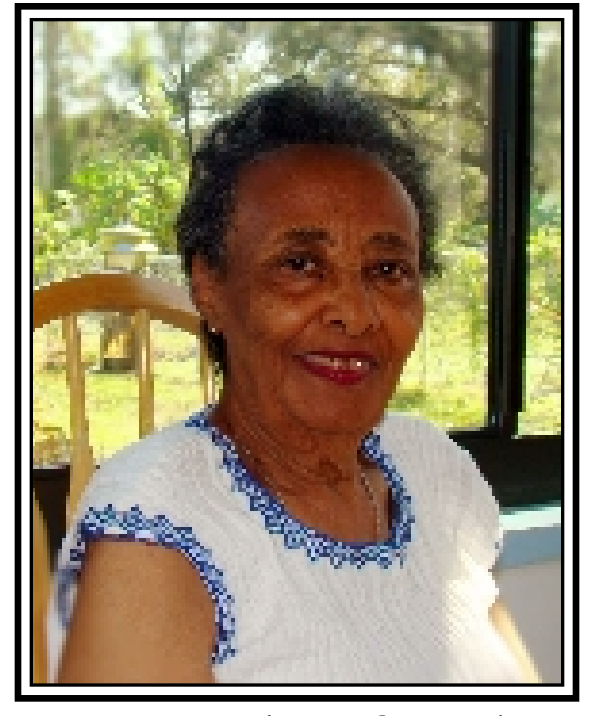
Return unto thy rest, O my soul; for the Lord hath dealt bountifully with thee. Psalm 116: 7