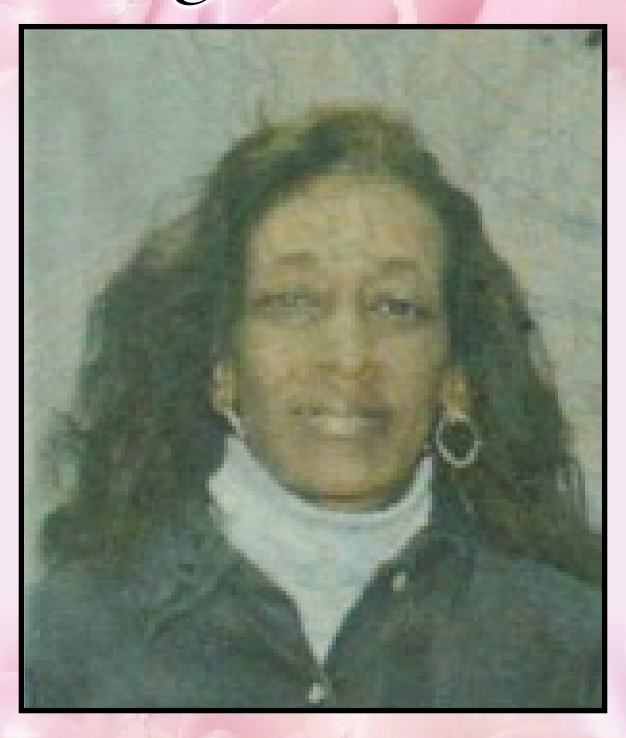
Sunrise January 23, 1959