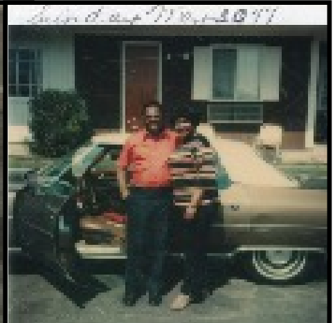
Wedding March 30 1977