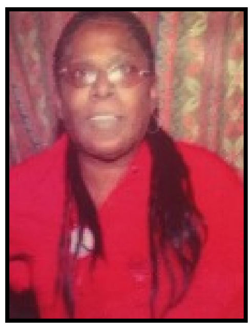
Interment Rosedale Cemetery Linden, New Jersey