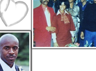
Repast Linden Roswell Community 1238 East St. George's Avenue • Linden, NJ 07036