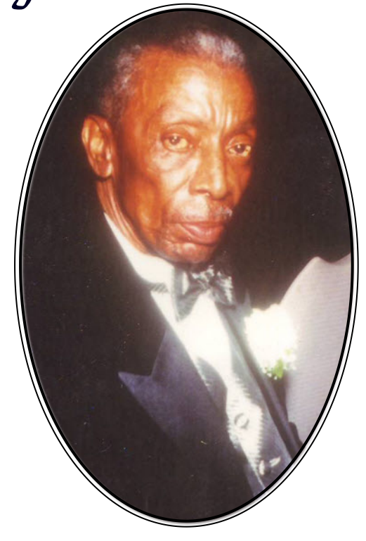
Sunrise January 12, 1929