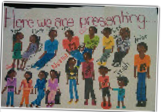
By Jada Dawn (Great Granddaughter)